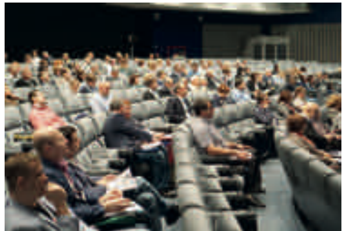
...and generated a great deal of interest amongst the listeners