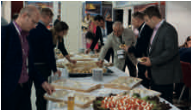
The Welcome Reception on the evening prior to the core event is an ideal opportunity for welcoming business partners and initially striking up contacts