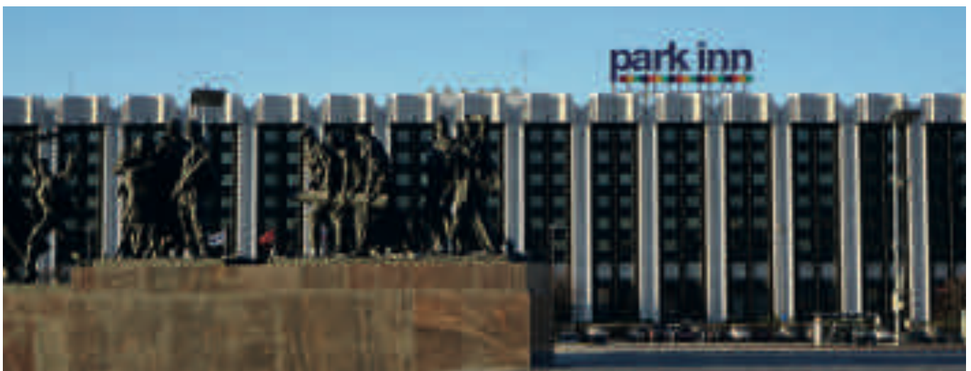
The conference hotel, Park Inn Pulkovskaya, in St. Petersburg offers the ideal setting for ICCX Russia