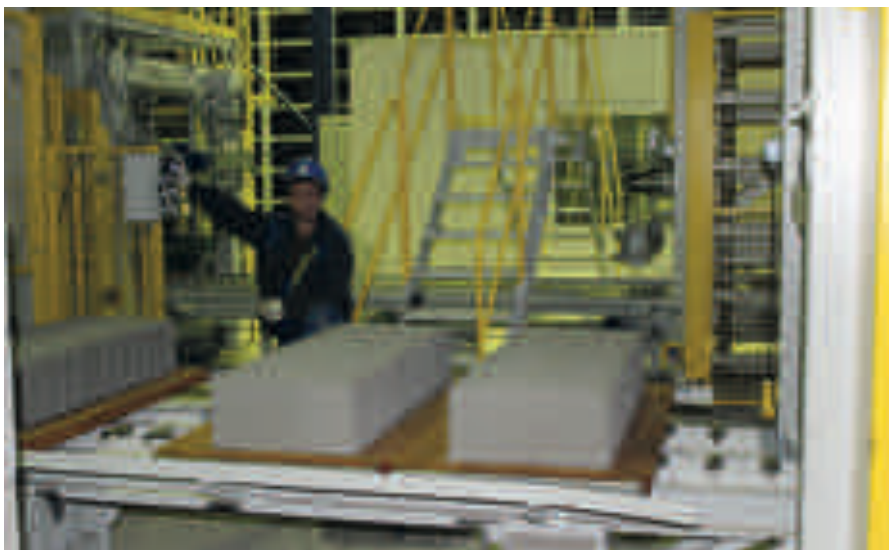
Plant tour at Murinsky OOO – this concrete production facility manufactures diverse precast concrete components and concrete products for residential construction