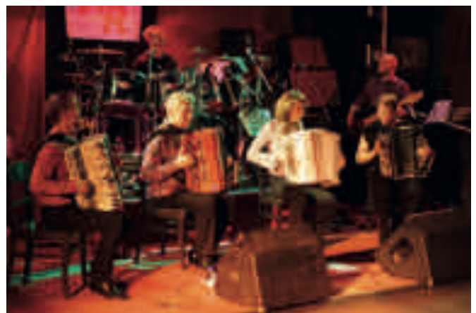
Large crowds at the ICCX Dinner Party. Approx. 600 guests did not want to miss the evening event. The guests could celebrate into the early morning hours in a sociable atmosphere against a background of typical live Russian music